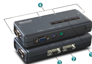
SP214EL 4 Port KVM Switch