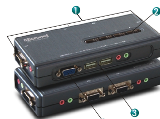
SP214D 4-port USB KVM Switch