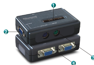
SP212EL 2 Port KVM Switch