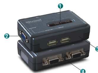
SP212D 2-port USB KVM Switch