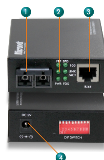
SP373 Series 10/100M Media Converter