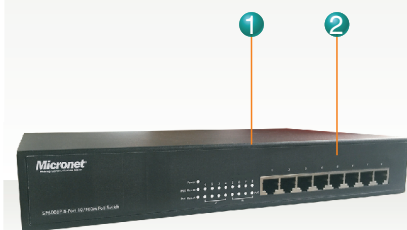
SP6008P 8-port 10/100M PoE Switch